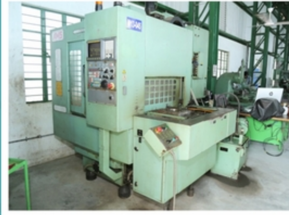
CNC VERTICAL MACHINING CENTRE