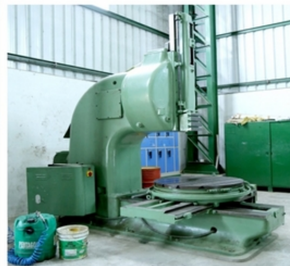
SLOTING MACHINE - 2000 Dia x 700 STROKE