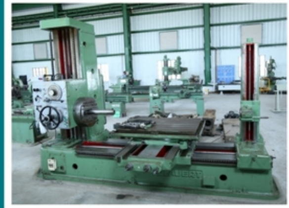
HORIZONTAL BORING MACHINE