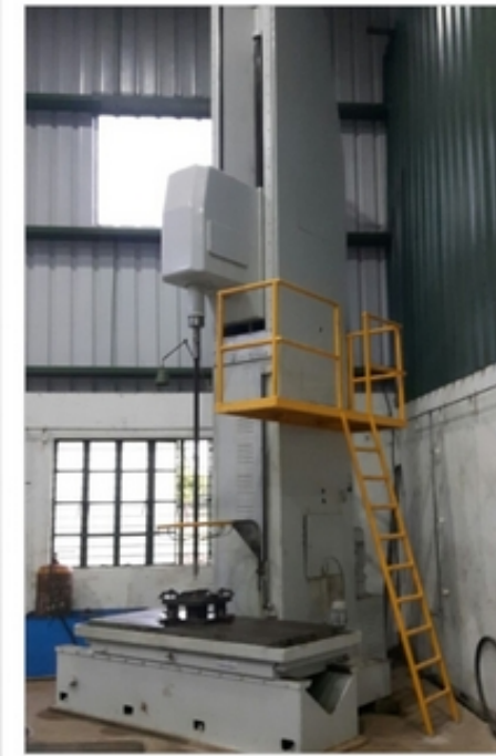
VERTICAL HONING MACHINE FOR LARGE DIAMETERS