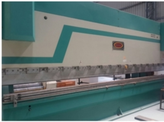
HEAVY DUTY BENDING MACHINE 4000 x 16mm