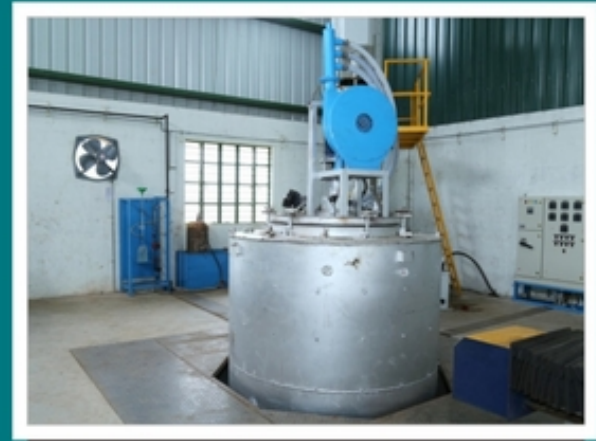
NITRIDING - 4m LONG