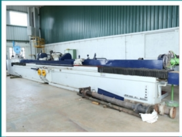
CYLINDRICAL GRINDING - 5000 mm LONG