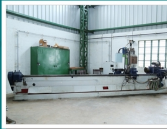
LONG THREAD MILLING - 5000 mm LONG