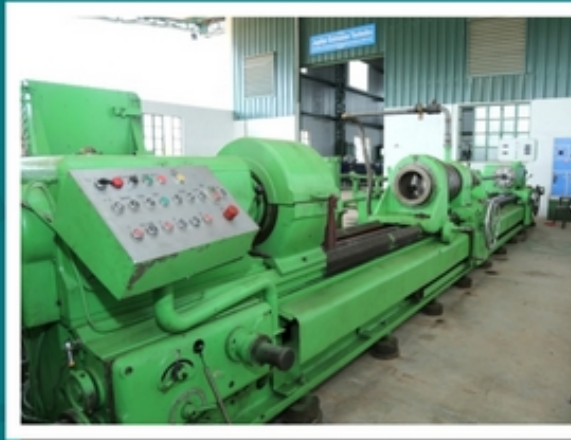
DEEP HOLE DRILLING - 4m LONG