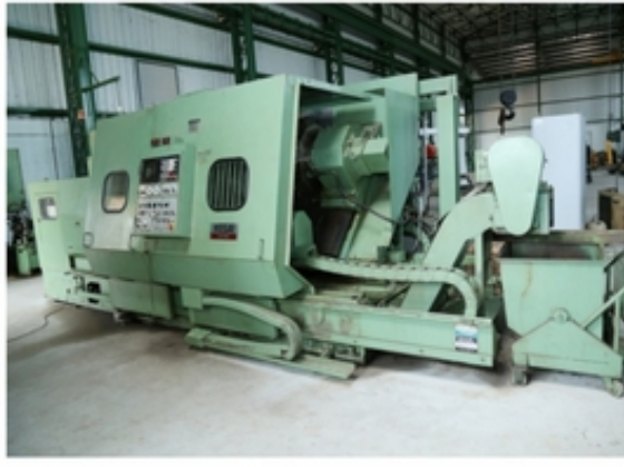
CNC TURNING CENTRE