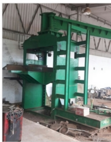
HEAVY DUTY HYDRAULIC PRESS