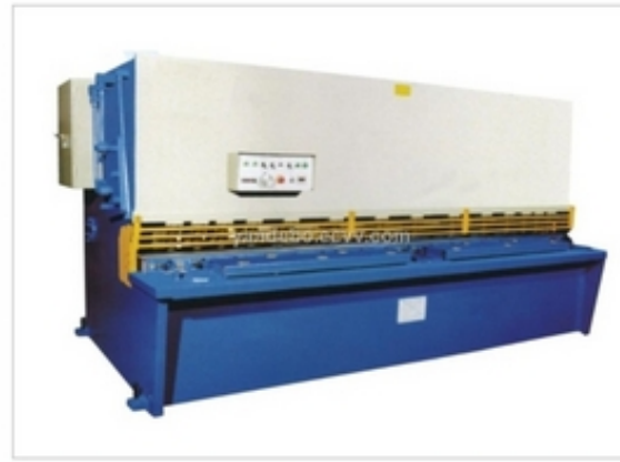
HYDRAULIC SWING BEAM SHEARING MACHINE 3000 x 4mm