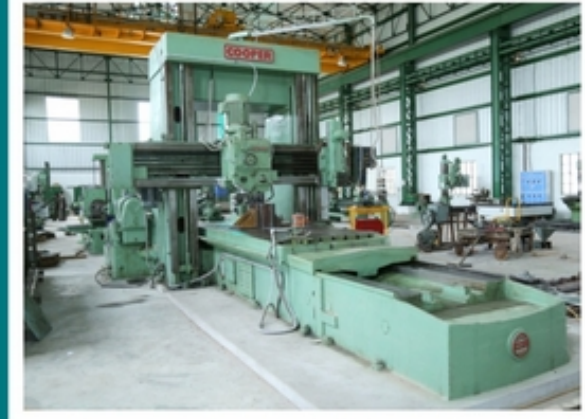
PLANO MILLER - PLC 4000 x 1400W x 1400 HT