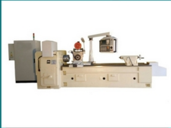
CNC LONG THREAD MILLING