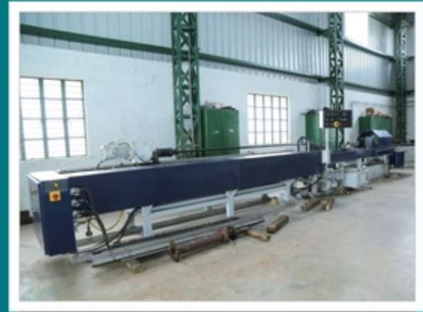
HONING - 5000 mm LONG