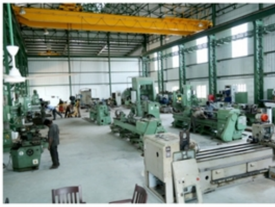
HEAVY DUTY LATHES & MILLING (Machine Shop Photo)